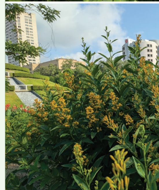
Orange Peel Cestrum ( Cestrum 'Orange Peel' )