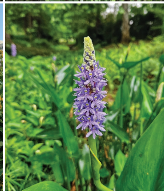
Pickerelweed ( Pondetaria cordata )