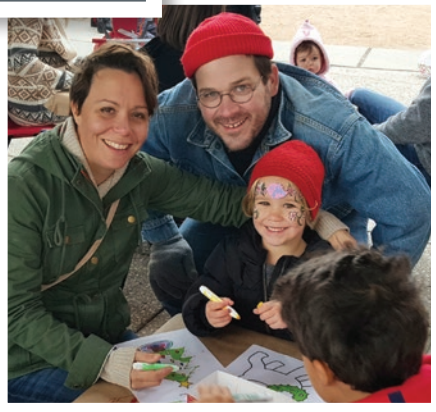
The holiday party was filled with family fun