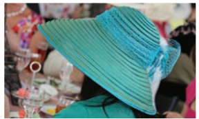
HATS IN THE PARK see page 10