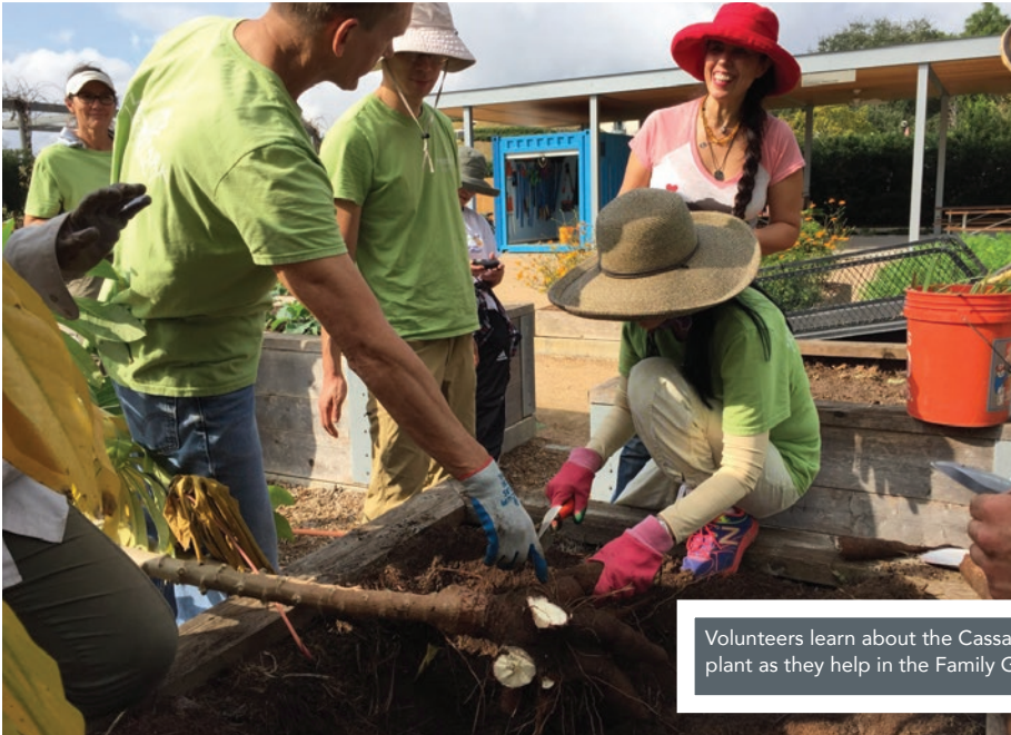
Volunteers learn about the Cassava plant as they help in the Family Garden

On a hot December morning, McGovern Centennial Garden volunteers harvested Yuca, also known as the Cassava plant, or Manihot esculenta . They enjoyed learning how to harvest and propagate this edible starchy root. It's featured in many cultures' cuisines, including Brazil, Nigeria and Thailand. Native to South America and parts of the Caribbean, it is also used to make tapioca. It's a drought-resistant crop and can be prepared in many ways. Try cooking it like a potato or as a sweet cassava cake or pudding. Be sure to check out all of the varieties of plants in the Family Garden. You can visit hermannpark.org/familygarden for a guide to the trees in the garden.