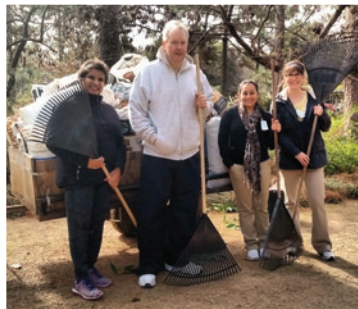
Mentis volunteers enjoyed working in the Park as part of their therapy

While volunteering in the Park helps in the therapy process, it also benefits the Park. The group raked pine needles in the Japanese Garden, filling more than a dozen bags to be used throughout the Park.