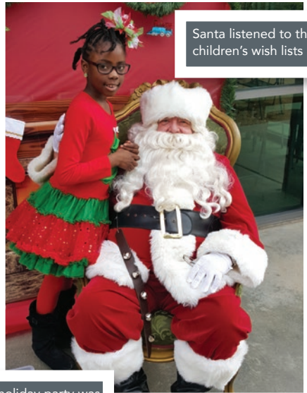
Santa listened to the children's wish lists

Throughout the holiday season, visitors could enjoy the decorated Hermann Park train featuring garlands and colorful lights, sparkling into the night. Riders enjoyed the magical touch of the glowing lights as the train wound through the Park. Pinewood Cafe extended its hours, as well, giving riders a chance to get a snack or a warm drink before or after the train ride.