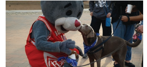
Houston Rockets Dog Walk Saturday, March 7, 8–10 am Lake Plaza