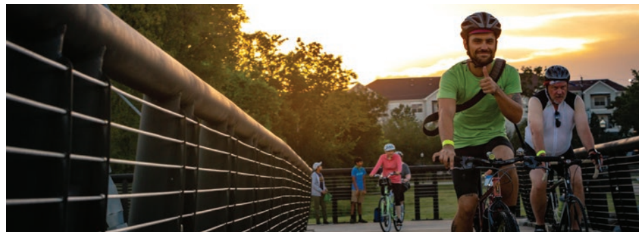
Bike Your Park Saturday, April 11, 10:30 am – 12 pm McGovern Centennial Gardens