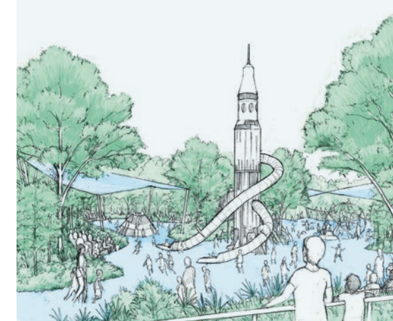
A rendering from MVVA depicts the rocket slide, a major icon of the upcoming Commons project

One of the first steps is inviting Park stakeholders to attend several "Deep Dive" meetings that focus on these projects. Held at McGovern Centennial Gardens, these morning and lunchtime sessions give you a chance to get an in-depth look at the planned projects, followed by a roundtable discussion of what these projects will entail. These discussions will be offered once a month, and are free to attend. Registration is required.