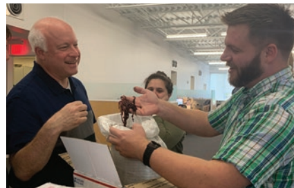
Office staff unpack the worms, which were shipped via USPS

One morning I walked into the Conservancy offices and I found several of the office staff on hands and knees, combing through the carpet, searching for runaway Red Wiggler worms.