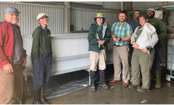
Horticultural staff stand in front of the new vermicomposting unit