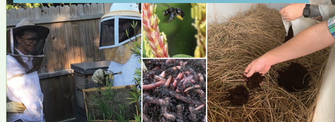
Left: Shelley Rice and Kyle Wolfe tend to the bees; Center Top: Black Bee; Center Bottom: Just a few of the hundreds of worms now calling the Park home; Right: Workers tend to the vermicomposting bin.