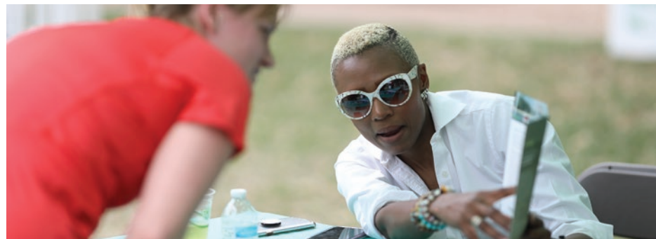
Love Your Park: Member Volunteer Day Saturday, March 7, 7:00 – 10:30 am Lake Plaza

For a full list and more information, head to hermannpark.org/MemberEvents .