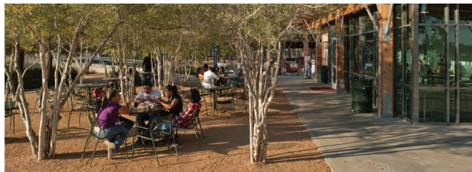
Member Burger Night Thursday, May 7, 5:30 – 7 pm Pinewood Café