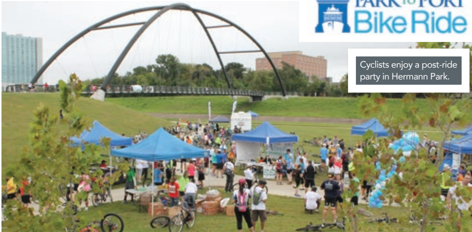
Cyclists enjoy a post-ride party in Hermann Park.

Houstonians of all ages joined in a two-wheeled celebration of the centennials of both Hermann Park and the Houston Ship Channel on September 13, 2014. Nearly 1,000 cyclists rolled off the starting point near the Bill Coats Bridge in Hermann Park for the Conservancy's Park to Port Bike Ride. Cyclists made the 20-mile round-trip along the Brays Bayou trails to the Houston Ship Channel then back to Hermann Park. From the banks of the bayou, riders saw Houston from a new perspective. Many discovered that the Houston Ship Channel is closer than they thought