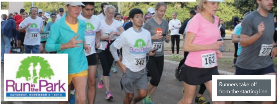
Runners take off from the starting line.

More than 600 runners, joggers, and walkers positioned themselves at the start line for Hermann Park Conservancy's 11th Annual Run in the Park, held on November 8, 2014. The run benefited the Conservancy and brought avid runners and enthusiastic walkers to the Park as well as family and friends who cheered them on. Run in the Park consisted of a 5K run/walk and a popular