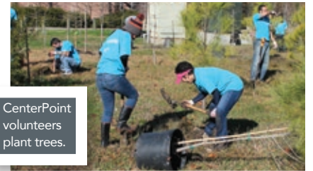
CenterPoint volunteers plant trees.

CenterPoint Energy donated 142 native trees to Hermann Park in December for the tree kindergarten in the eight-acre Lake Picnic Area. The 7- and 15-gallon trees, planted by Conservancy staff and volunteers, were a welcome addition to the growing woodland picnic site in a formerly "wild" area that was in great need of tender loving care. With improvements over the past several years to the site's drainage, installation of an irrigation system, addition of wooden picnic tables, a swing set for the kids, and improved access with new concrete and gravel paths and lighting, the site is being transformed into a delightful, shady first-come, first-served