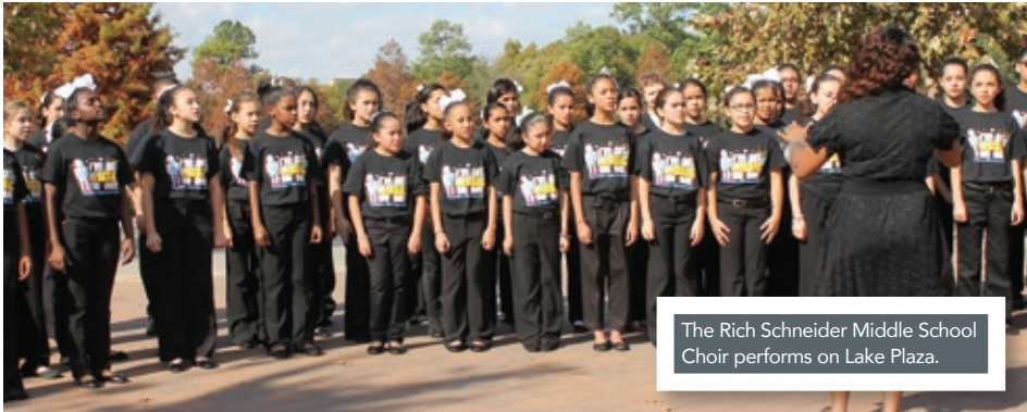
The Rich Schneider Middle School Choir performs on Lake Plaza.

Direct Energy focuses on community involvement and decided to make a difference in the lives of students from Rich Schneider Middle School. After the school's youth choir completed their concert as part of our 5th Annual Student Performances in the Park Series, Direct Energy leaders from several continents took the time to talk to each student