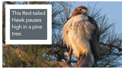
This Red-tailed Hawk pauses high in a pine tree.