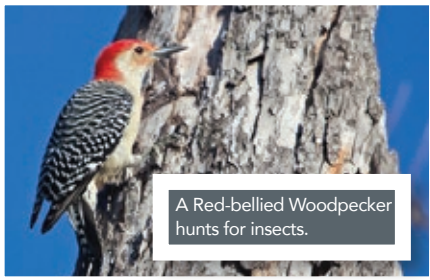
A Red-bellied Woodpecker hunts for insects.

Hermann Park is for the birds! Literally. The Park is home to many species of local and migratory birds. Monthly, Houston Audubon members conduct a free bird survey in the Park. Feathered visitors and residents include Green and Yellow-crowned Night Herons, Cooper's and Red-tailed Hawks, as well as Red-bellied and Downy Woodpeckers. Some water-loving species include the Black-bellied Whistling-Duck, Neotropic Cormorant, and the American Coot. There have also been recent sightings of the impressive Bald Eagle.