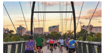
Park to Port Bike Ride Saturday, November 16 Bill Coats Bridge