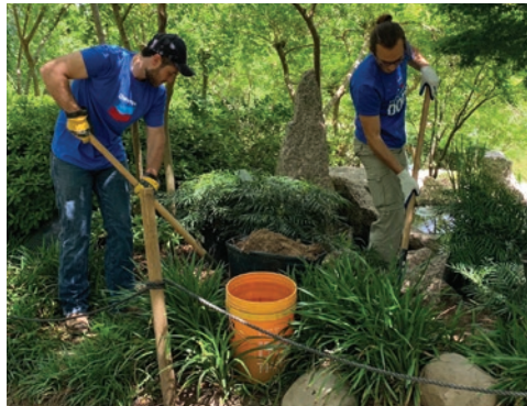
Volunteers from Chevron plant new ferns along the walkways in the Japanese Garden.