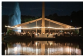
EVENING IN THE PARK see pages 6-7