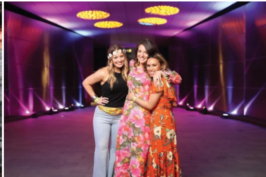
Top: Many dressed to the 60's theme of Peace. Love. Park ; Above Left: The scene at Peace. Love. Park ; Above Right: As guests entered McGovern Centennial Gardens, the Pavilion's walls were lit up like lava lamps.

It was a packed party at McGovern Centennial Gardens on Thursday, May 16, as Urban Green held their spring fundraiser party. To celebrate warmer weather and the arrival of spring blooms, the party was called Peace. Love. Park. and was a salute to all things 1960s and flower power.