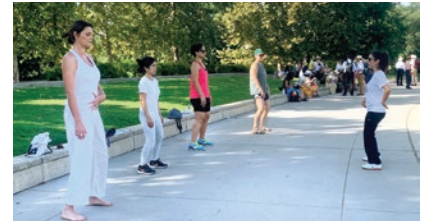
Tai Chi in the Park Every Wednesday, 9 am McGovern Promenade, Lake Plaza