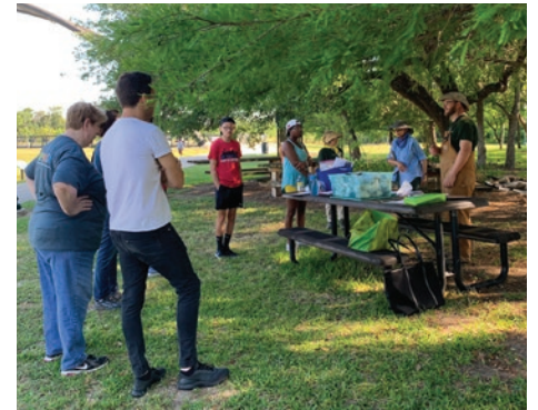
Representatives from NEEF and other volunteers gather to get their tasks for the day.

Volunteering at Hermann Park looks different every day. From weeding and mulching plant beds to restoring picnic tables and benches to removing invasive plant species to office work in the HPC offices, there's something for every level of green thumb.