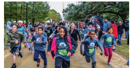
16th Annual Run in the Park Saturday, October 5, 8 am Molly Ann Smith Plaza