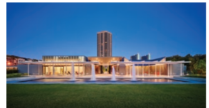
Member Sip & Stroll Thursday, October 17, 5:30-7 pm McGovern Centennial Gardens