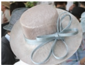
HATS IN THE PARK see pages 4-5

The Circle of Animals/Zodiac Heads is presented by the Houston Arts Alliance in partnership with the City of Houston, Houston Parks and Recreation Department, Hermann Park Conservancy, and AW Asia.