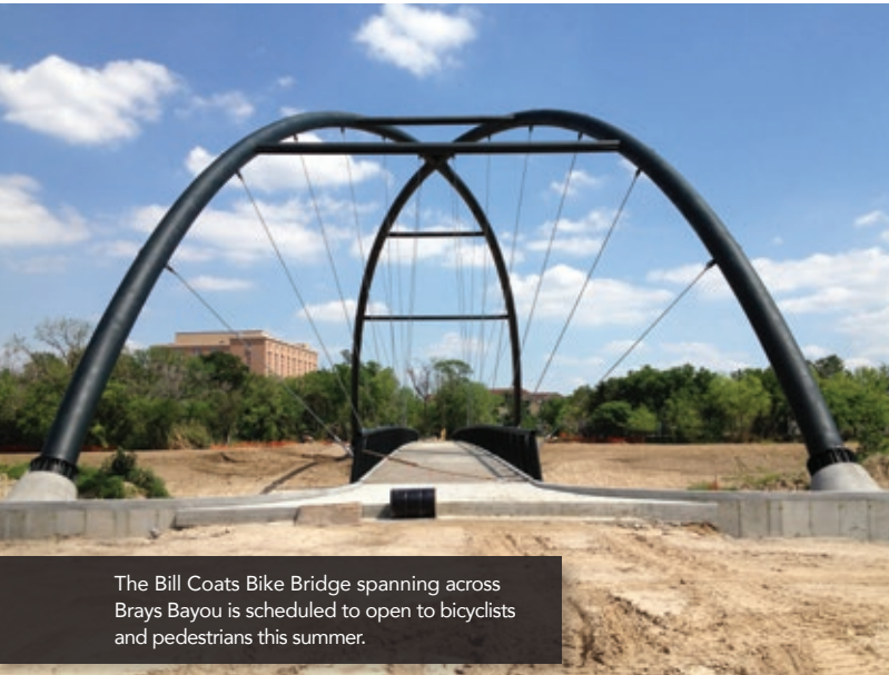
The Bill Coats Bike Bridge spanning across Brays Bayou is scheduled to open to bicyclists and pedestrians this summer.

Art and architecture are coming together to bridge the banks of Brays Bayou. Spanning 290 feet, the modern, double-arch Bill Coats Bike Bridge will soon connect Hermann Park's bicycle and walking trails on both sides of the bayou.